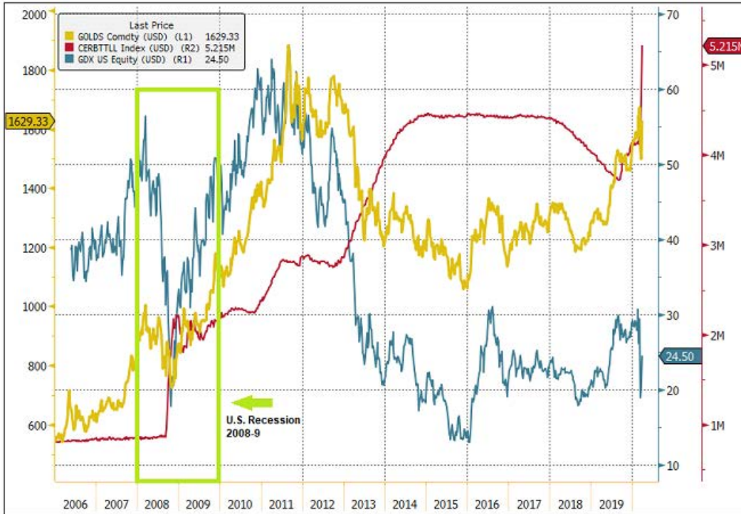
Figure 2. Fed Balance Sheet vs. Price of Gold Bullion and Gold Equities

Source: Bloomberg. Data as of 3/27/2020. The red line represents reserve credit outstanding in $ trillions ($5.125 trillion as of 3/27/2020). The yellow line is the gold spot price based on GOLDS Comdty Index. The blue line is the price of gold mining equities represented by GDx. 3